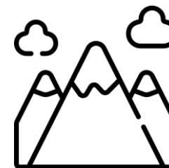
Mt Blanc – 4810m